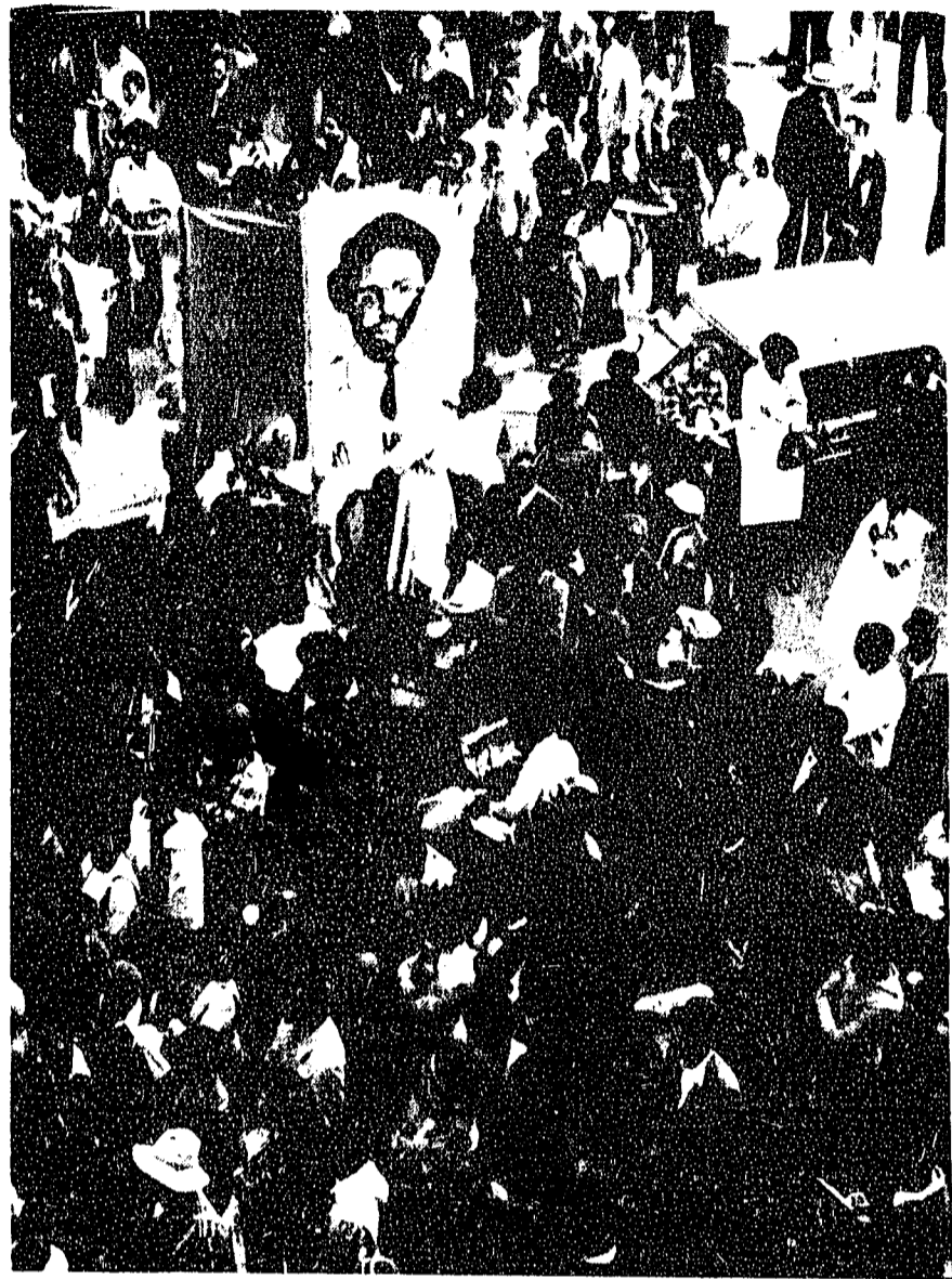
Banners of Arthur Miller and Malcolm X at the rally