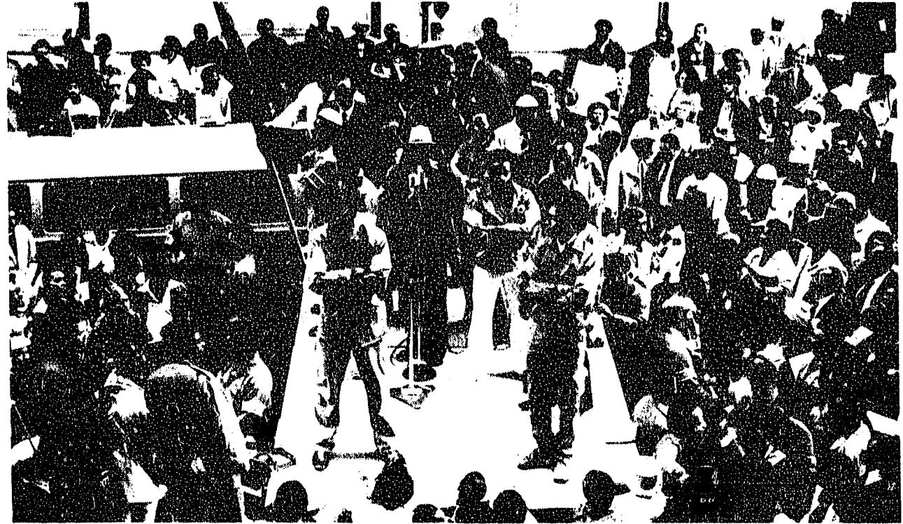
Reverend Daughtry speaking at rally

Following this the crowd assembled and rallied on Murry Street and Broadway. A platform was set up and a number of distinguished black activists made speeches amplified by bullhorns. Flo Kennedy sang a warning song which included the words, "Move on over or we will move on over you. Black folks time has come."